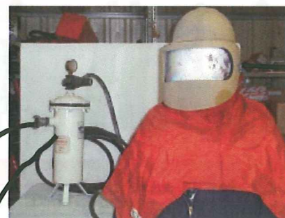
Hose supplied with air purifier