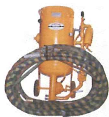
A Sandblaster 300# With 50' sandblast hose