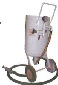
B Sandblaster 100# With 15' sandblast hose