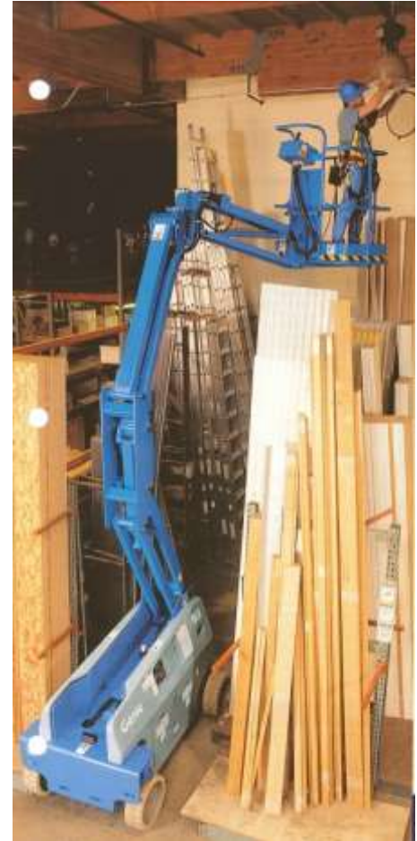
5' Articulated jib allowing 200 degree rotation