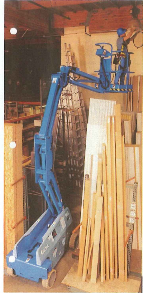
5' Articulated jib allowing 200 degree rotation