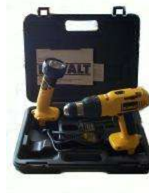
B Cordless drill