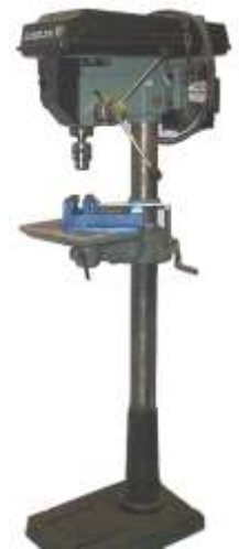
C Drill press