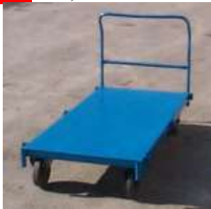
D Cart, 30" x 60"