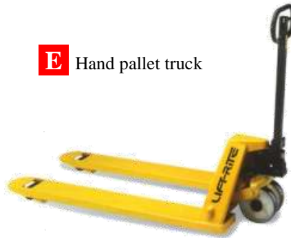
E Hand pallet truck