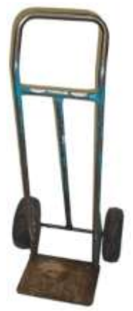
C Hand cart