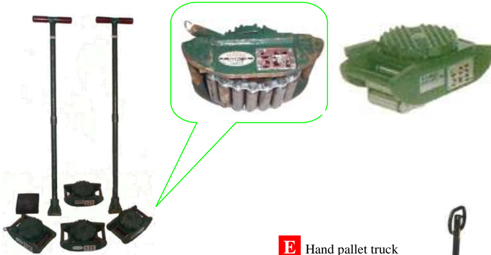
A Machinery rollers, 15 ton