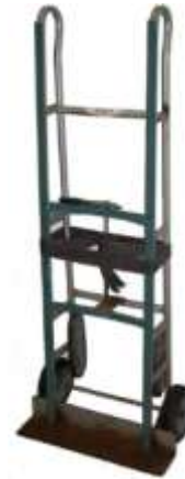
B Fridge cart