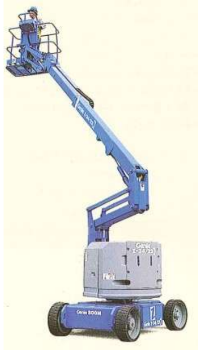
Z34/22N #1598 2285