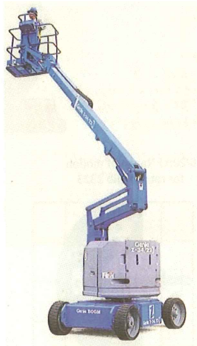
Z34/22N #1598 2285