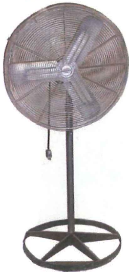
A Pedestal fan