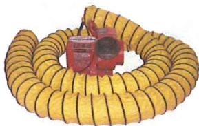
E Exhaust fan 8"