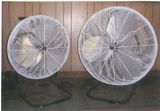
C 36" Floor fan