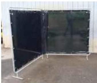
C Welding screen door panel