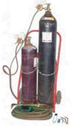
A Acetylene torches