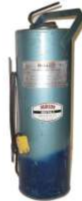
B Rod oven