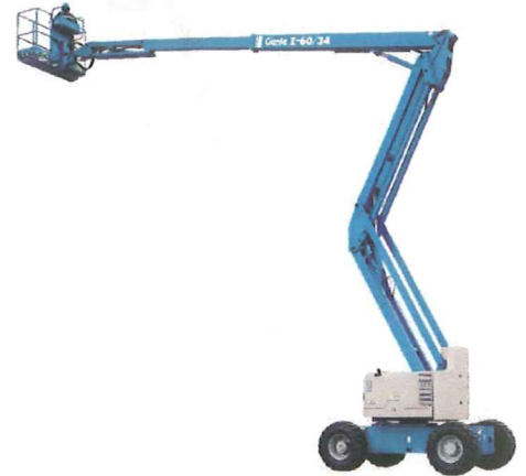
Genie Z60/34 2427, 2577, 2581