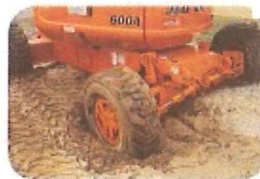
4-Wheel Drive and Steer Options

An innovative articulating joint is now available on both telescopic and articulating models. For improved up-and-over height and increased horizontal outreach, articulating models feature a completely revised boom configuration. All models provide higher-strength booms for less deflection and an improved sense of stability.