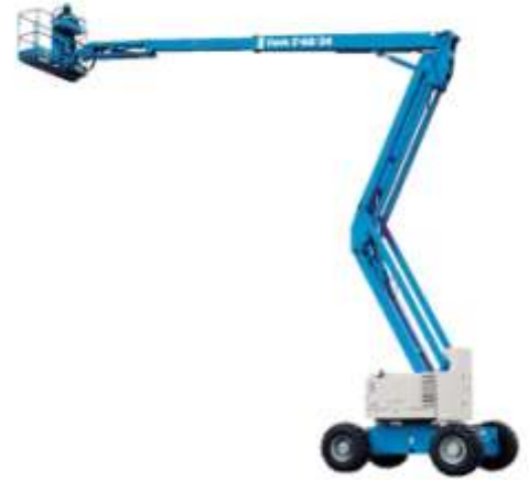
Genie Z60/34 2427, 2577, 2581