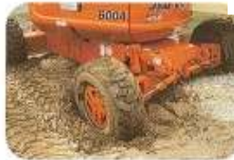
4-Wheel Drive and Steer Options

An innovative articulating JB is now available on both telescopic and articulating models. For improved up-and-over height and increased horizontal outreach, articulating models feature a completely revised boom configuration. All models provide higher-strength booms for less deflection and an improved sense of stability.