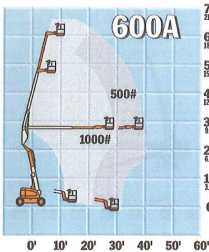
JLG 600AJ Manlift 2426