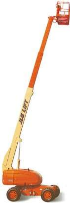
JLG 600S Manlift 2054