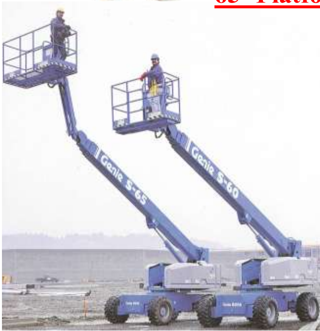
Genie S65 Manlift 2165